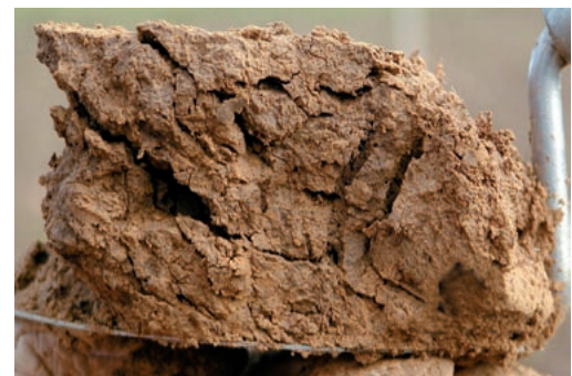
Compacted soil