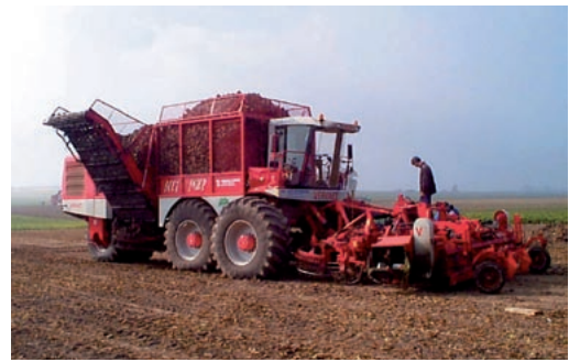
Harvester for sugar beet