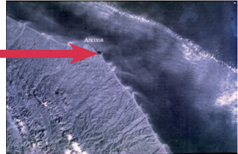
Occurrence of sediment in the Mediterranean Sea due to transport of soil particles from eroded inland fields (Italy)