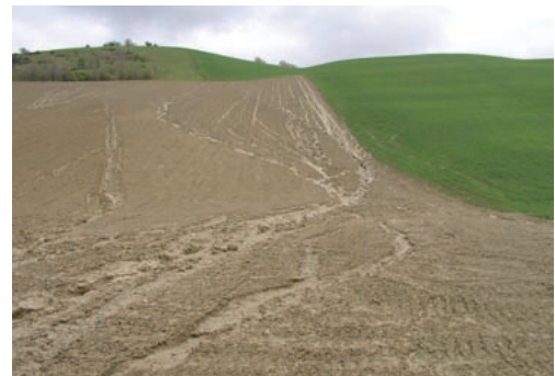
Example of rill erosion and re-deposition of sediment at the base of the slope

An estimated 115 million hectares – one eighth of Europe’s total land area – are subject to water erosion, and 42 million hectares are affected by wind erosion. The Mediterranean is particularly prone to erosion when heavy rain occurs after long dry periods.