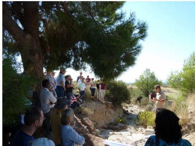
Joint field visit in the DESIRE project in Spain.

The assumption that science is politically neutral leads to a situation of non-engagement, whereas real change is only possible when scientific results are dispersed carefully and according to a well-planned strategy. DESIRE has taken a courageous and progressive step by involving NGOs throughout the project, encouraging all project partners to plan outreach to policy makers together. During the various project stages scientists were challenged to formulate and present their results in ways to make it relevant for policy makers, and to think about policy scenarios beyond the mere technocratic interventions; an exercise that sometimes proved difficult. Both scientists and NGOs have learned from this collaboration.