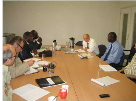
Both ENDS and partner NGOs visiting the Dutch embassy in Dakar, Senegal.

can be a good way to avoid the above problem. However, there is a great difference between basic research for gaining scientific knowledge and applied research, and the way of organising the work is different as well. Secondly the project needs to accommodate both scientific and NGO partners, which requires a careful setup. From our experience in the DESIRE project, key guidelines we found useful for developing a successful collaborative project are: