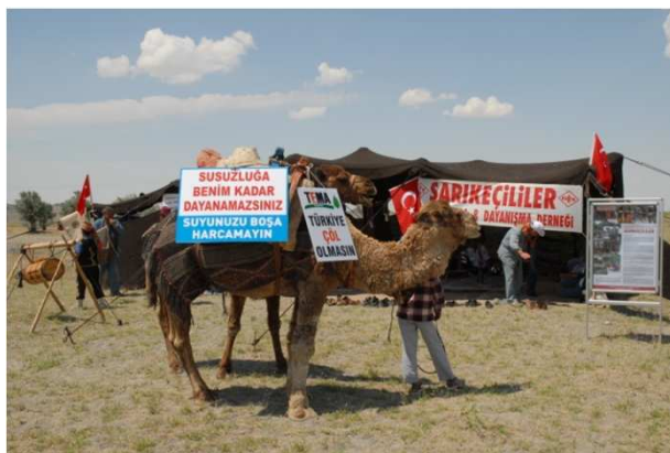
Another way of organising a press conference on dryland management in Turkey. By TEMA, 2007.