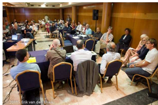
DESIRE round-table with Spanish policy makers.

More information on the DESIRE approach can be found in the book “Desire for greener land - Options for Sustainable Land Management in Drylands” (in press, University of Bern - CDE, Alterra, Wageningen UR and ISRIC – World Soil Information), or on the DESIRE website http://www.desire-his.eu/ . More guidance for scientists on reaching out to policy makers can be found in the publication “DESIRE guidelines to writing a policy brief” (January 2011, downloadable from http://www.desire-his.eu , section Research Themes – Facilitating dissemination).