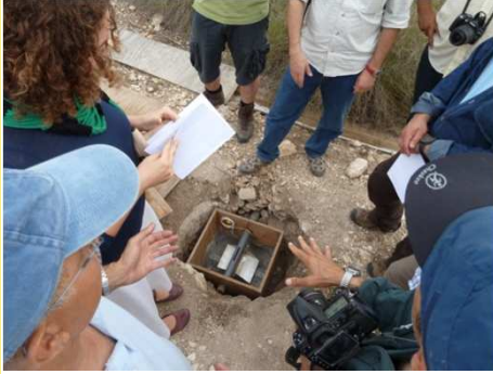
DESIRE field visit in Spain.

Scientists get credit and recognition by publishing in English language scientific journals, because of how the scientific system is currently organised. Any work done for society or the common good is not scientifically appreciated and only takes time from scientific publishing, therefore making it more difficult for those who do want to publish for a non-scientific audience for example. Joint research projects that aim to go beyond the scientific publishing, sponsored by donors that encourage such aims,