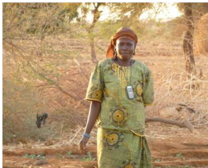
Farmer in Niger.

For instance, in order for NGOs to be taken seriously by policy makers and the international community, NGOs need to formalize their concerns and views. One way of doing this is by getting issues addressed in scientific fact-based, high quality publications. NGOs can learn from the sound evidence scientists use to build arguments and statements. NGOs are frequently unaware of the latest scientific publications which could otherwise be of great value to them, and working with scientists allows NGOs to have better access to scientific information. When NGOs get to co-define the research question(s), they can even ensure that the research deals with current affairs and political debates the NGO is involved in. Often, NGO statements based on scientific research raise their reliability. Scientific knowledge is typically understood to be explicit, systematised, decontextualized and hence widely transferable. This is sometimes referred to as “know-why”, since scientific knowledge partly attempts to understand the underlying principles and theory behind observable phenomena (against “know-how” coming from local practitioners and experience).