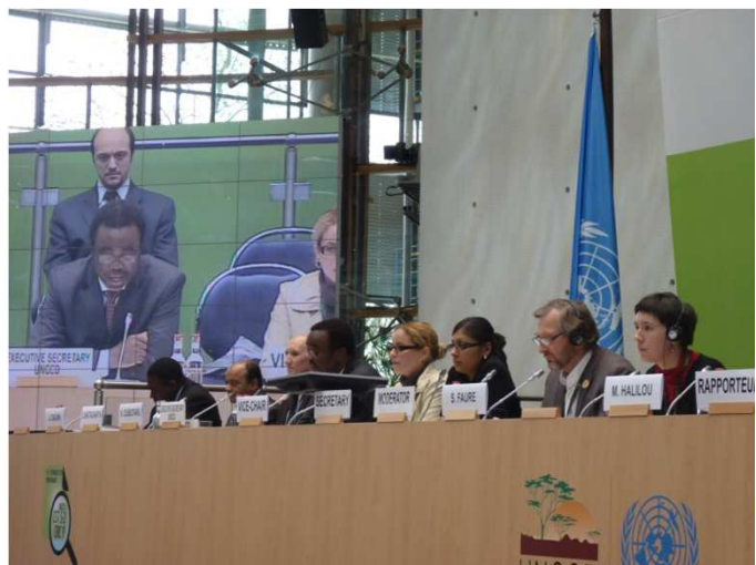
NGOs presenting ideas at UNCCD CRIC9 conference. By CARI, 2011.

Despite their differences in approach and methodology, there are nevertheless numerous reasons for scientists and NGOs to join hands in collaborative projects. Participation in joint research projects can help scientists better define their research questions. NGOs working in an area for a long time have an overview of the relevant stakeholders, and can complete the picture in the study site by adding the reality of the field to the scientific model or system. They know the range of stakes in the area, and are able to give an integrated picture of all the factors influencing decision-making on land management issues. This saves the scientist the effort of having to find this all out during the research, and gives him/her a head start. At the end of the research the NGOs will remain in the area and can ensure that research results continue to be used. Politicians change too often to follow long-term scientific research, but NGOs can ensure constant updates are provided to new politicians. Researchers are consulted by policy makers for fact-based, objective advice. NGOs can provide insights on the social context which may prove useful to complement the facts.