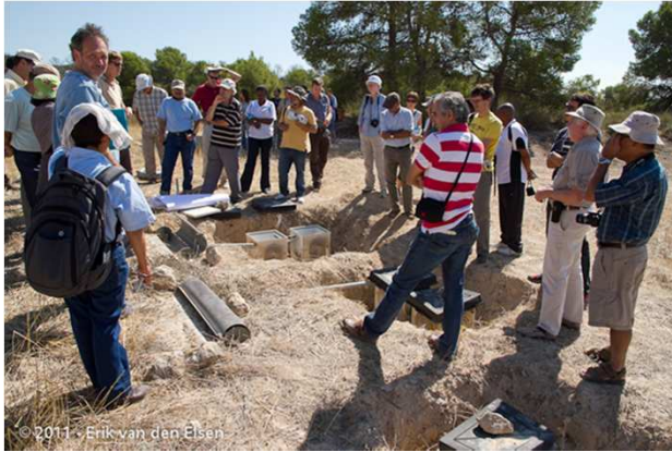
Joint field visit in the DESIRE project in Spain. By Alterra, 2011.

A lot of valuable lessons can be learned from this rich collaboration, for future partnerships between researchers and NGOs, and for research projects with an aim to contribute to societal debates related to land use issues in drylands. In order to draw these lessons, we characterize both scientists and NGOs. This way, potential differences, problems and advantages can surface more easily.