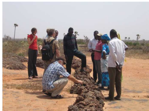
Examining stone bunds in farmer fields in Senegal.